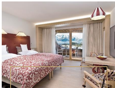
90 DOUBLE ROOMS