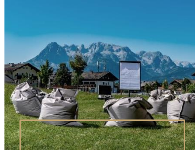
A DIFFERENT KIND OF MEETING