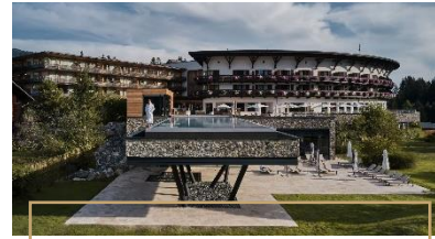
IFEN HOTEL KLEINWALSERTAL