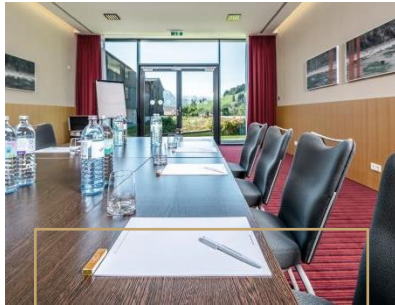
IN THE HOTEL

With our many years of experience and passion as hosts, we are happy to support you in your planning.