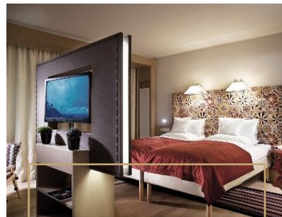
20 JUNIOR SUITES