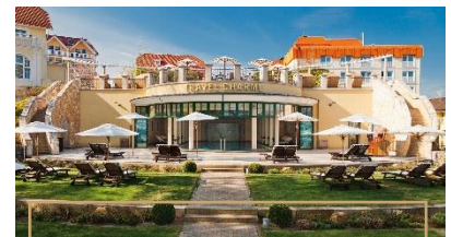
NORDPERD & VILLEN GÖHREN