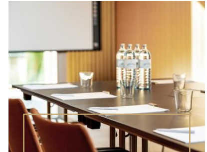
CAPACITIES & RATES