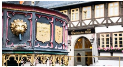
GOTHISCHES HAUS WERNIGERODE