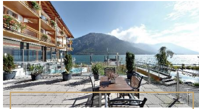
FÜRSTENHAUS AM ACHENSEE

Travel Charme Hotel GmbH & Co. KG Budapester Strasse 10 - D-10787 Berlin